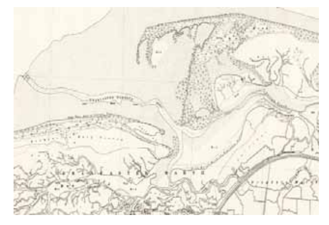
Scolt Head Island map